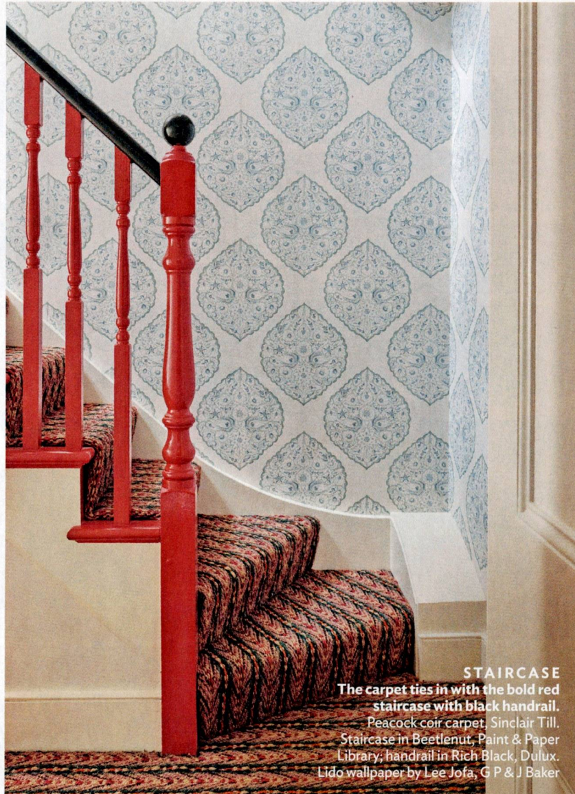
STAIRCASE The carpet ties in with the bold red staircase with black handrail. Peacock coir carpet, Sinclair Till. Staircase in Beetlenut, Paint & Paper Library; handrail in Rich Black, Dulux. Lido wallpaper by Lee Jofa, G P & J Baker

'PUTTING A POP OF COLOUR WHERE YOU LEAST EXPECT IT ADDS CHARACTER - WHETHER THAT'S ON THE STAIRS OR A CEILING'